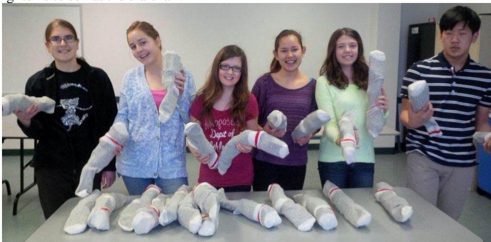
The Youth Group filling socks for the Warm Feet for the Street program

Big thanks to all the adults who supported the YG in these projects. We are grateful to those who helped with sewing, baking and providing items to sell at the craft fair.