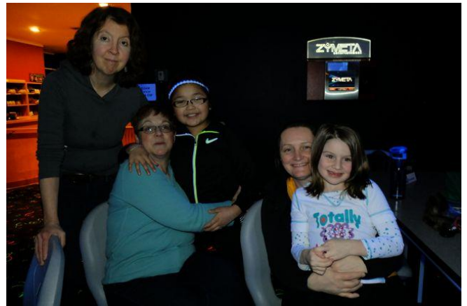
YKUC Bowling Night