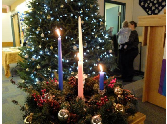
Christmas Advent Wreath