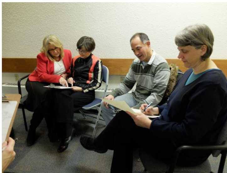
The collective writing of the Prayers of the People