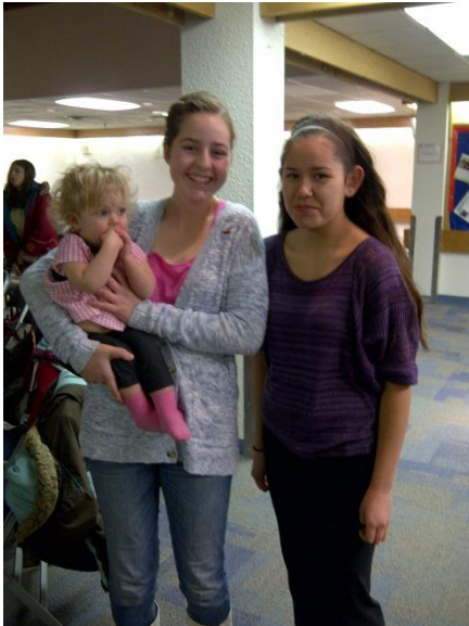
YKUC's three Emilys