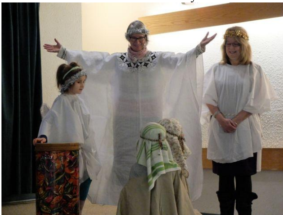
The Christmas Pageant