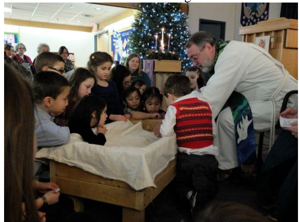
Christmas Eve Service