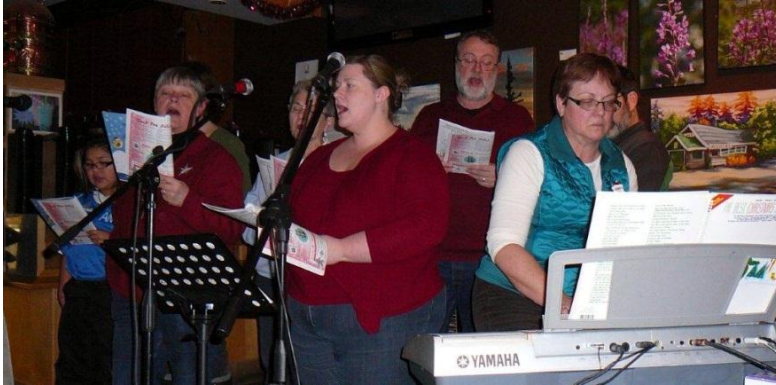
YKUC Choir participates in a carol sing at Javaroma in December