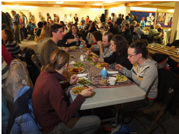
The community enjoying a taste of Somalia