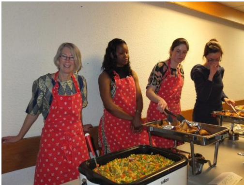
The hosts of the Somali dinner