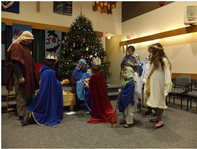
Baby Jesus receiving the gifts from the Wise Men