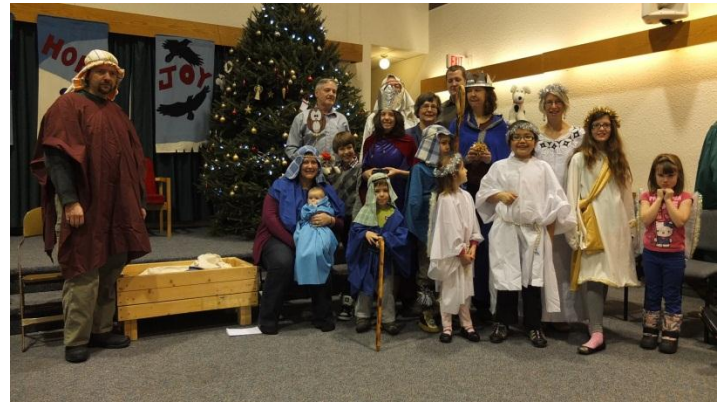
The cast of the Christmas Pageant