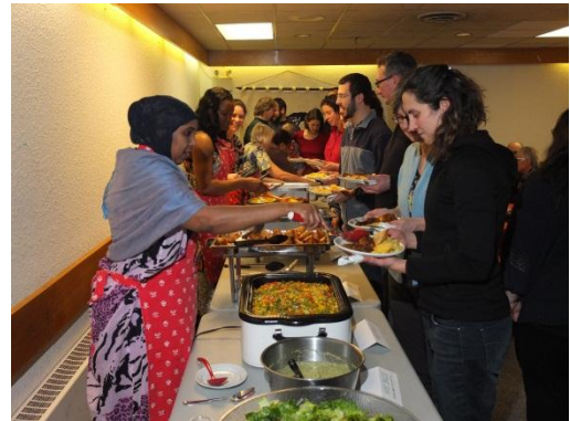
Serving up the feast