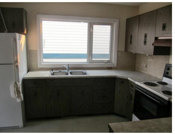
Kitchen before renovations