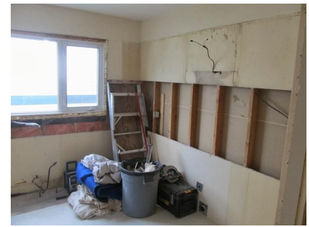
Kitchen during renovations