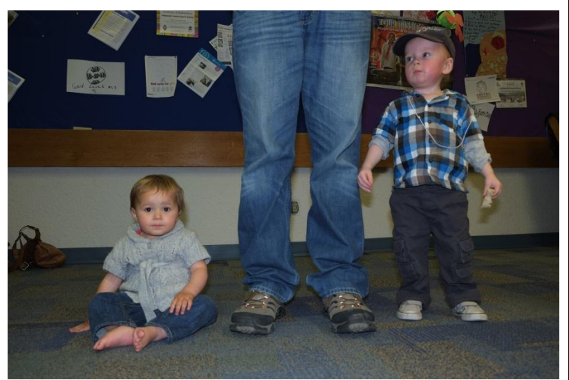
Young & old enjoyed the fall supper