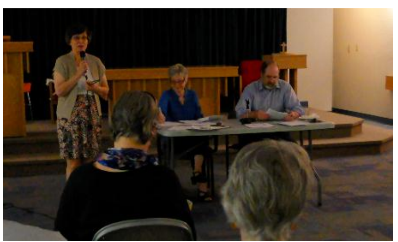
Work of the church

The UCW would like to offer a special thank you to everyone who has supported us by donating their time, energy, and talents. Without the generous support of the congregation, UCW would not be able to function.