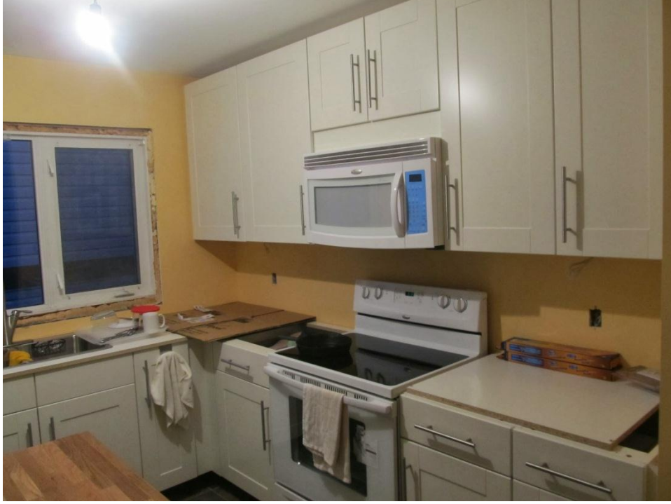
Kitchen almost finished